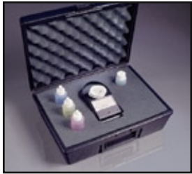
Porta-Kit with EP11/PH

All Myron L instruments are factory calibrated with Standard Solutions of known conductivity/TDS values and (when appropriate) with pH buffer values 4, 7 and 10. These solutions and buffers are traceable to the U.S. Government's National Institute of Standards and Technology.