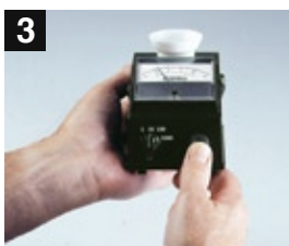
Push button to indicate reading