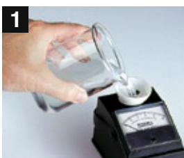
Rinse and fill cell cup