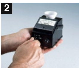
Select Conductivity/TDS range