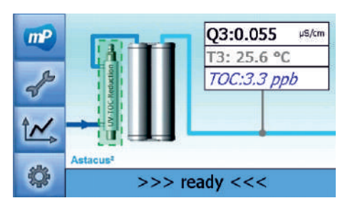
Main Screen: The Software allows the user to see all information to use maintenance tool and track back historical values up to 1 year.

Currently recorded data and warning messages will be displayed on the touch screen monitor. The software furthermore supports the user with a self-diagnostic module which reduced service time and costs.