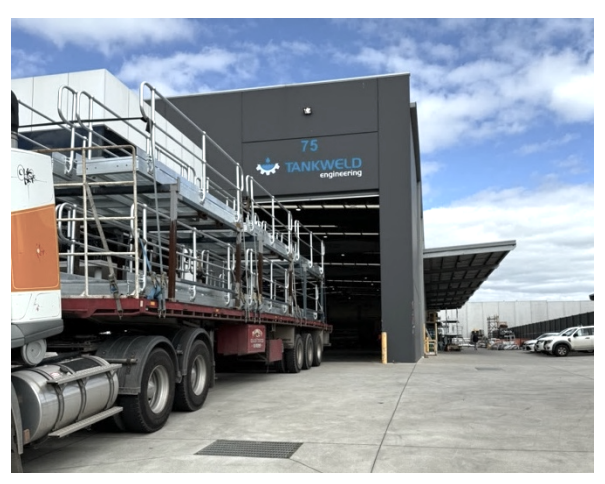
Figure 2b: Finished goods leaving fabrication workshop.