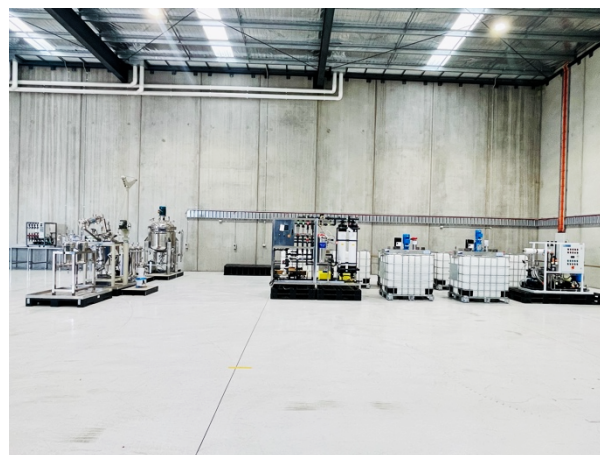
Figure 1d: Large-scale pilot plant equipment being assembled.