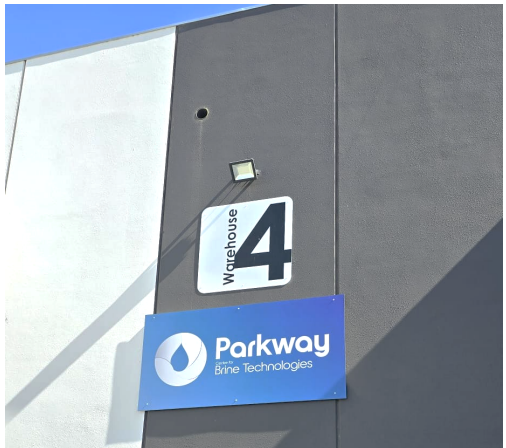
Figure 1: Parkway Centre for Brine Technologies (PCBT) – Photos of Recent Fit-Out Underway

In addition to certain piloting related costs being eligible for the research and development tax incentive (R&DTI) rebate, a proportion of the funding being invested to establish and operate the PCBT, is expected to be provided from a range of external sources, including grant-based funding.