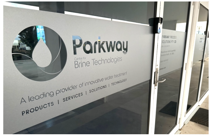
Figure 1b: External research facility signage (office entrance).