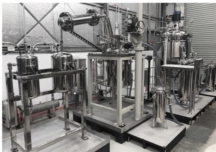
Figure 1: New iBC ® Pilot Plant, installed at Victoria University, Institute for Sustainable Industries & Liveable Cities (ISILC)

The feasibility study contract which was awarded to the Group by QGC (a Shell Group company) during FY22 will incorporate a range of process piloting related activities, including with the New iBC ® Pilot Plant, as shown below ( Figure 1 ).