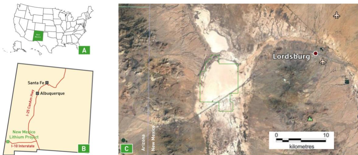
[A] Map of the United States of America. [B] Map of New Mexico (N.M.). [C] NMLP Claim Map. Maps and associated details are illustrative only and not to scale. Map does not reflect recent claim consolidations.

The NMLP is based on the large central portion of the Lordsburg Playa in the Animas Valley in southwest New Mexico ( Figure 2 ). Parkway Minerals has earned a 70% interest in the project by funding tenement renewals and early stage exploration activities and has the right to move to 100% ownership. The project is located in a region of high heat-flow as evidenced by regional geothermal activity and is highly prospective for lithium and potash in hypersaline brines interpreted to be present beneath the playa. During the quarter, the Company continued to engage potential farminees, however farm-out negotiations have been significantly impacted by COVID-19 related disruptions. The Company received several expressions of interest, however, is still assessing options to move the project forward, despite COVID-19 related challenges. In order to provide maximum optionality, the Company has received proposals from a number of contractors and has secured a range of approvals necessary to potentially drill-test the project with a single low-cost drill hole (estimated budget less than A$100,000) to assess the prospectivity of the interpreted shallow brines.