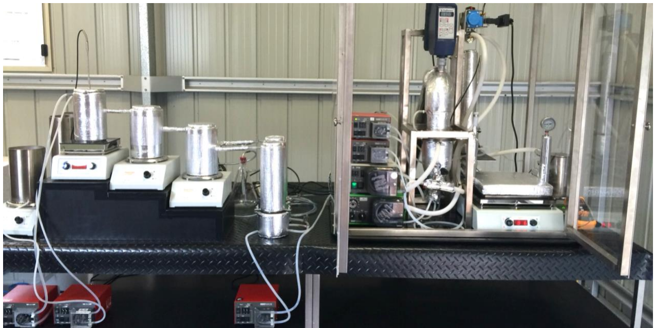
Fig. 2: iBC™ Pilot Plant Acquired by Parkway Minerals