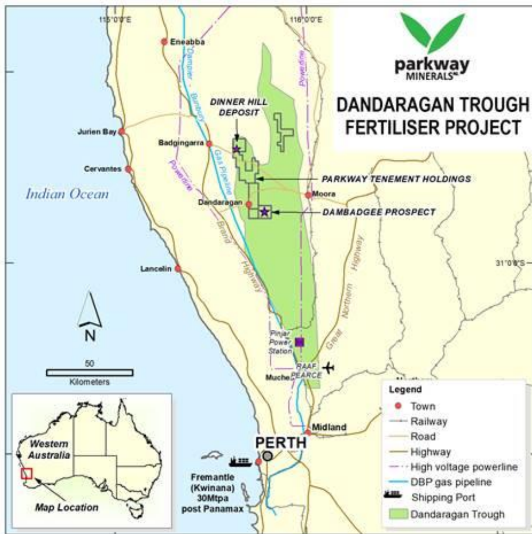
Figure 3: Location plan, Dandaragan Trough Project