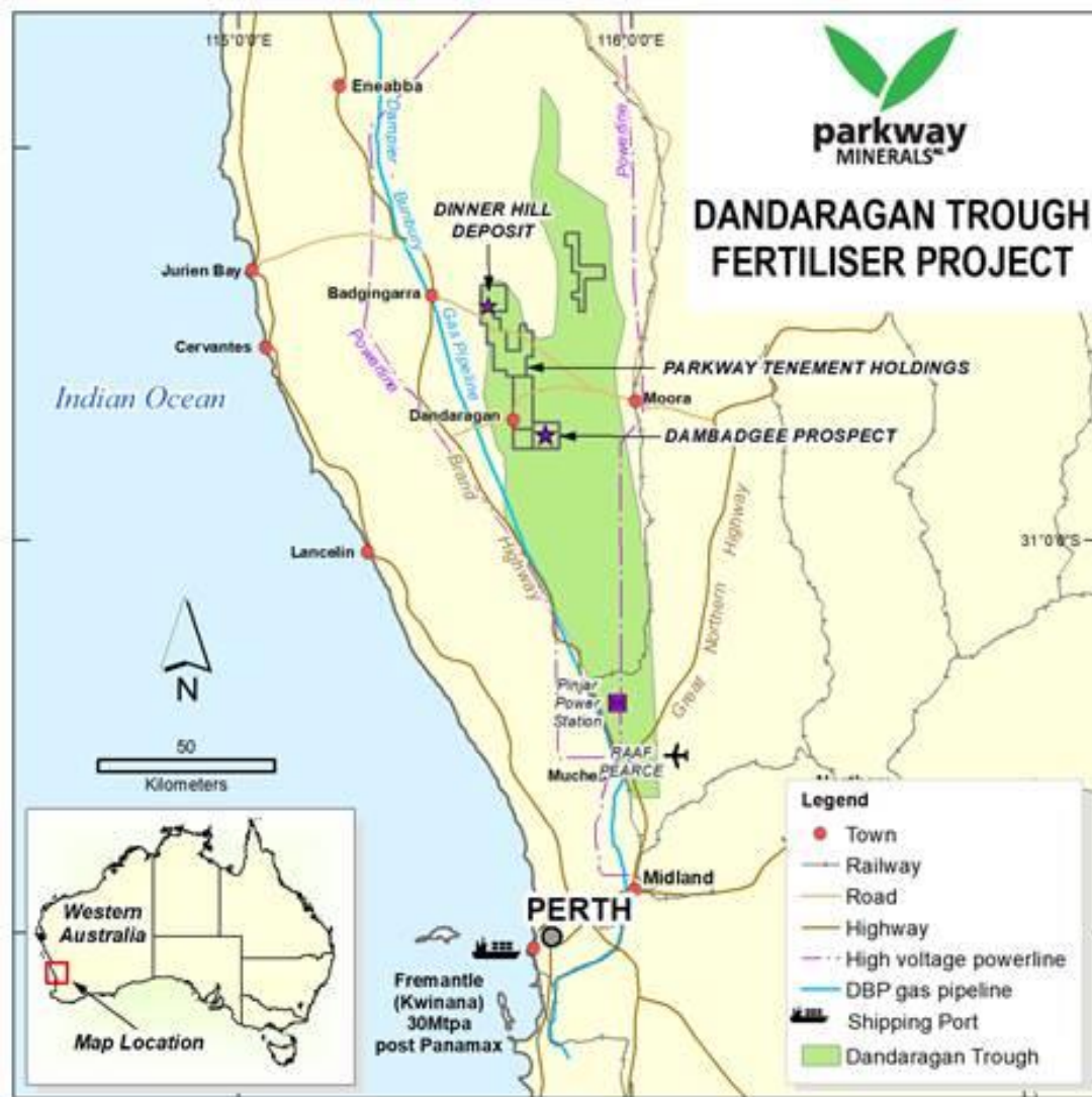
Figure 3: Location plan, Dandaragan Trough Project