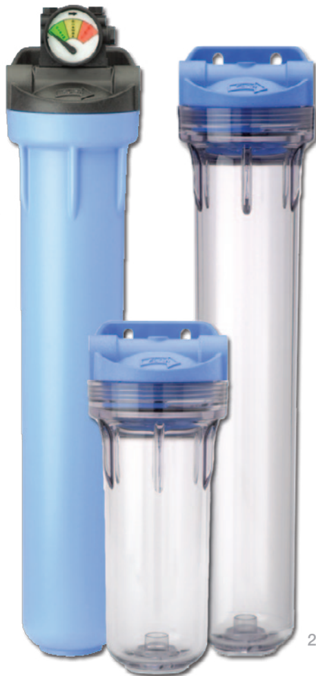
20" IB/MM Opaque with 143549 Meter*