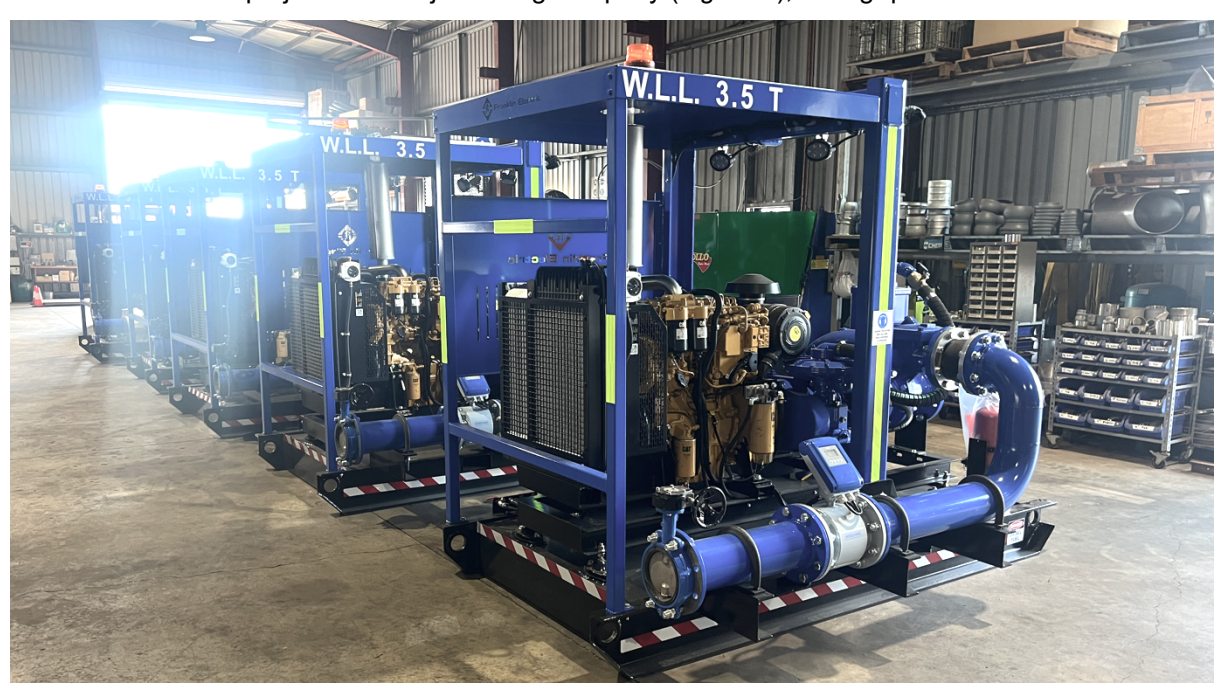
Figure 2: Industrial Diesel Pump Sets Supplied by PPS Undergoing Upgrades & Testing at PPS-Darwin

The industrial capabilities within PPS, are highlighted by the successful finalisation of a large-scale water infrastructure project for a major mining company ( Figure 2 ), during quarter.