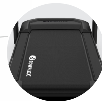
20" x 60" Running Belt