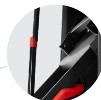
Kickstand Folding System