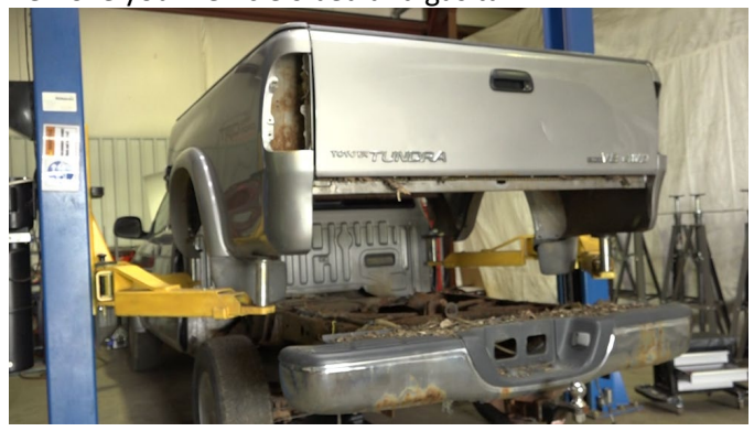
Remove the 2 bolts from the EVAP system support with a 12mm socket.