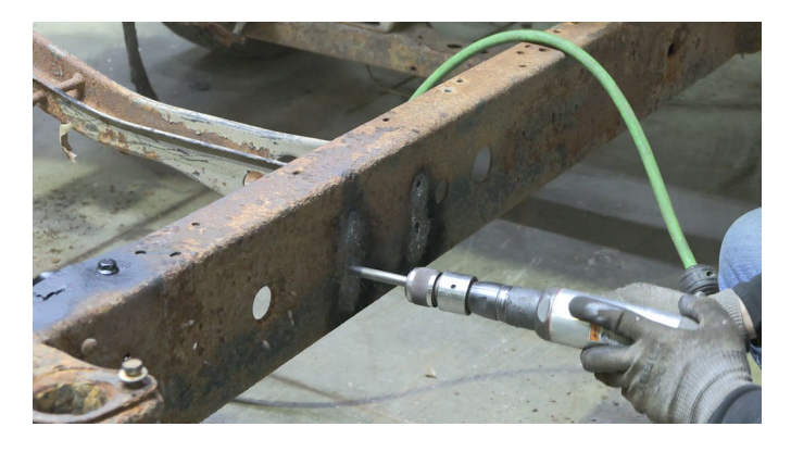
Remove the cross member.