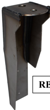
RB7345L & RB7345R