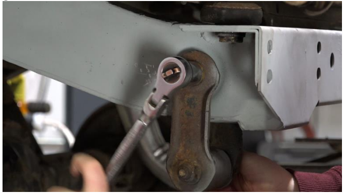
Reinstall your wheel. Reconnect your battery.

Rotate the shackle into place, send the bolt through, and secure the nut onto it. Reinstall your gas tank, cords, and tubes.