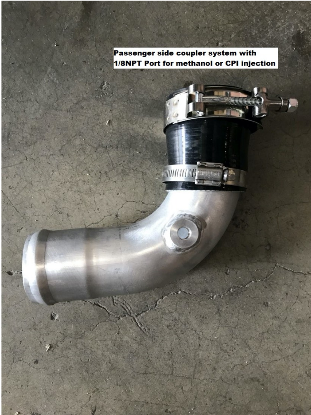
Passenger side coupler system with 1/8NPT Port for methanol or CPI injection

Passenger side. *NOTE* If you are not using CPI, or methanol injection. You will need to use the provided 1/8NPT plug or you will have a boost leak.