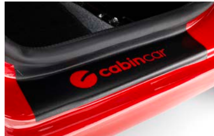
Door Kick Plates