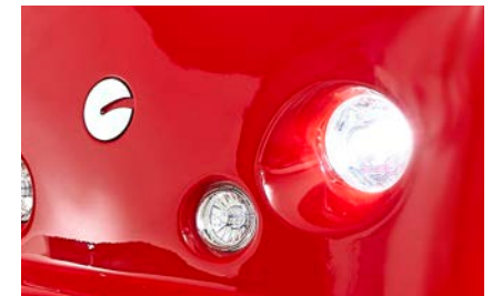
Powerful LED Headlights