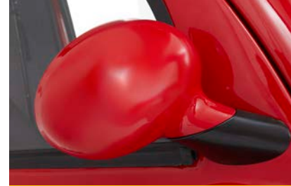
Body Coloured Mirrors