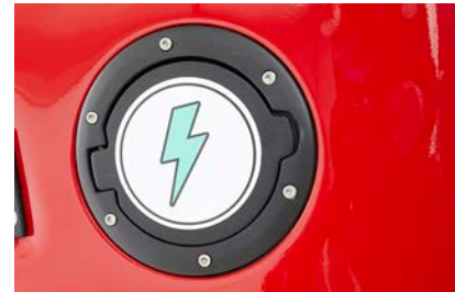
External Charge Port