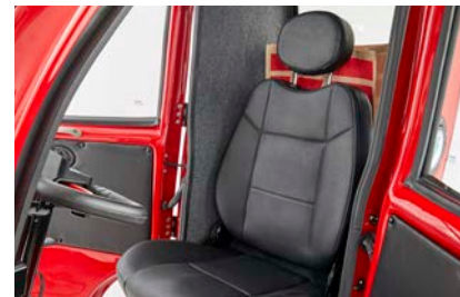
Luxury Captain Seat