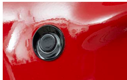
Rear Parking Sensors