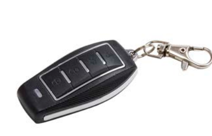
Remote Central Locking