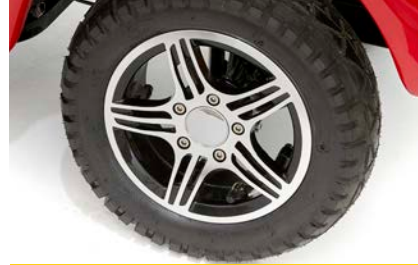
9" Alloy Wheels

Bright Rear LED Lights Dual-Speed Windscreen Wiper Durable Floor Mats Easy Access Doors Electronic Braking System External Charging Cable (0.7m) Finger & Thumb Controls Follow-Me-Home Lights Four-Way Adjustable Driving Position Large Cup Holder Smooth Acceleration System Super 1400 Watt Motor Trip Computer Twin USB Charging Ports Ultra Soft Suspension Windscreen Washer & Wiper