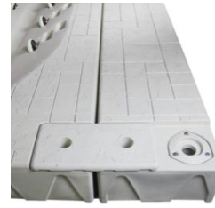
Side Extension Kit Adds 22" to width of Port 300115