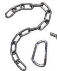
Tethering Chain and Clip 301269