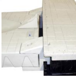
SLX to Wave Dock Attachment Kit 300998