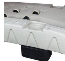
Buoyancy Booster 300498