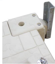
SLX to Floating Dock Attachment Kit 301308 - 19 3/4" C-Channel 301309 - 25 3/4" C-Channel