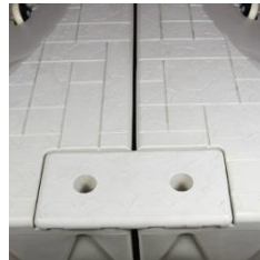
Port to Port Connector 300046