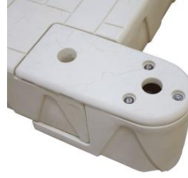
Post Extension Arms 300095 - Fits 2" Pipe 300096 - Fits 4" Pipe