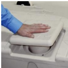
Snap-in Cap 300116