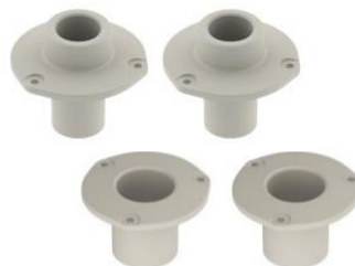
Pipe Sleeves 300103 - 2" Raised 301011 - 3" Flush 300041 - 4" Flush