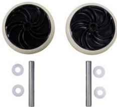
SLX Replacement Wheel Kit 300456