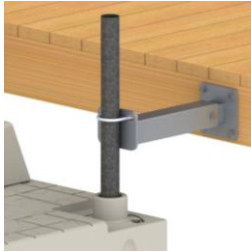
Telescoping Port to Fixed Dock Kit (Adjusts from 16" to 24") 301434 - Fits 2" Pipe 301435 - Fits 4" Pipe