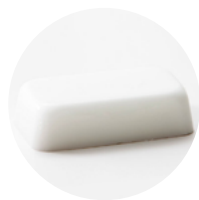
Crystal Triple Butter