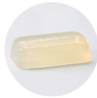
Crystal Jelly Soap