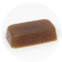
Crystal African Black Soap