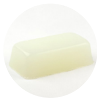
Crystal Aloe Vera