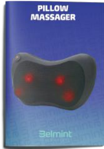
1 User Manual