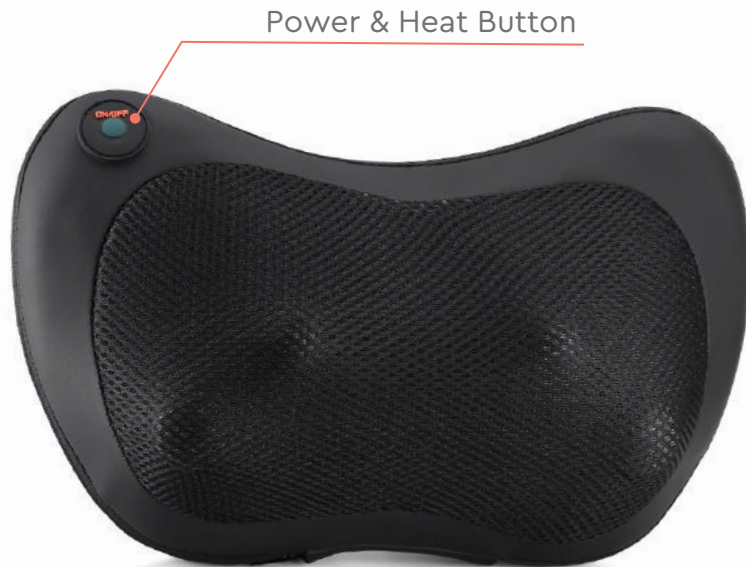
Power & Heat Button