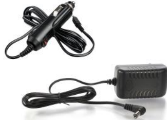
1 AC/DC Plug Adapter