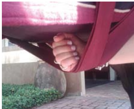
Fit surcingles with about four inches of slack.

If a horse sweats in his clothes, he will likely colic. So, determining a horse's warmth is critical. All horses are different. Stallions tend to run hot, mares can be inconsistent. First, feel his ears. If they are cold, the horse is already really chilled. It is good if the chest and shoulder are toasty, but not clammy. Also check the kidneys, over the flank. Some horses run very different there. A warm back promotes soundness. That is why it is a good idea to feel the kidneys. Always throw a cooler over them when horses are standing or walking when it is chilly.