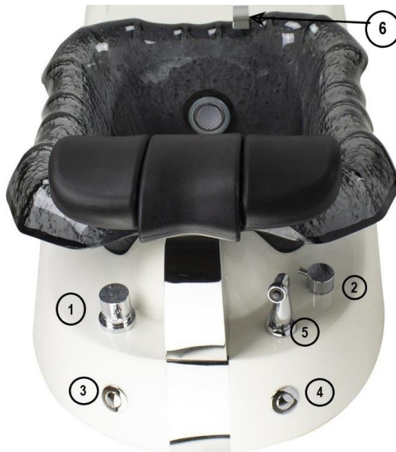
*Example tub in picture: SIENA Pedicure Tub

NOTE: For no plumbing, please physically empty and clean the basin. Floor drain plumbing will allow Pipeless Pedicure Chairs to drain out water automatically – no discharge pump needed.