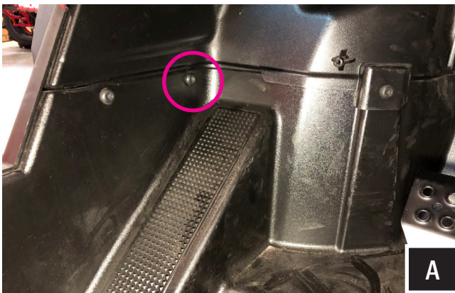
A. Starting at driver side footwell, remove the factory T40 torx screw as shown.