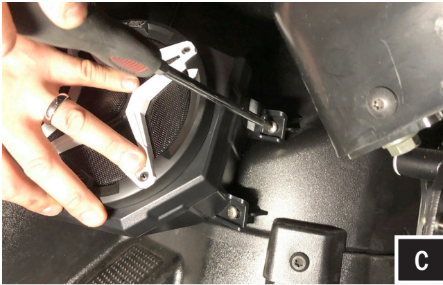
C. Using (x2) #14 screw loosely secure the kick pod to the factory screw bosses.