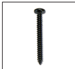
3. #7 Screws x8