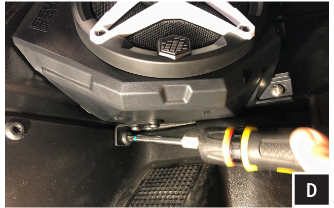
D. Re-use the factory T40 torx screw previously removed in Step A to loosely bolt through the lower kick pod bracket to vehicle panel.