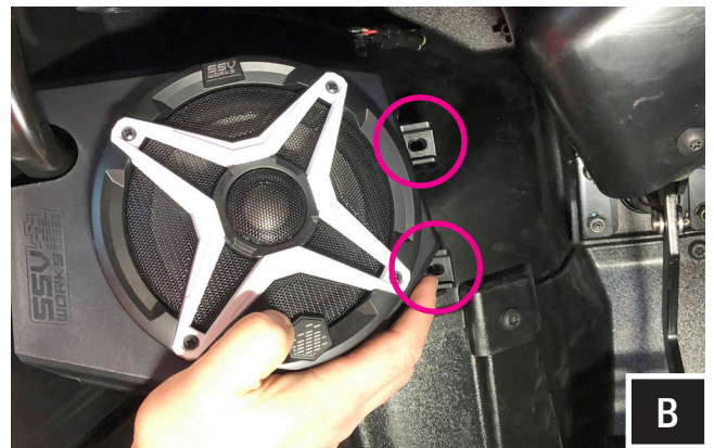
B. Place the driver kick pod into location so that both vehicle screw bosses line up with kick pod brackets.