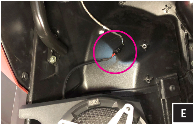
E. Connect the B-H1149 cable to the speaker pod and zip tie all cables to the frame.