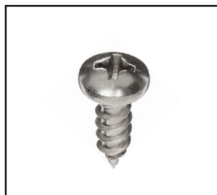
2. #14 Screws x4