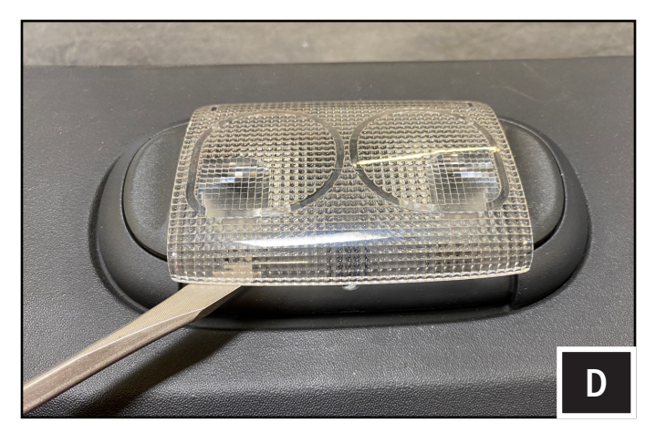
E. Using a panel removal tool or flat head screwdriver, unsnap the plastic dome light lens.