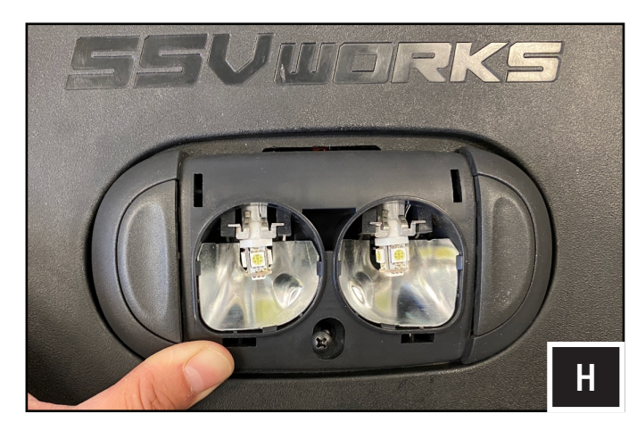
H. Hold down the domelight while fastening the provided SSV Works #2 Phillips screw to secure the dome light down to soundbar.