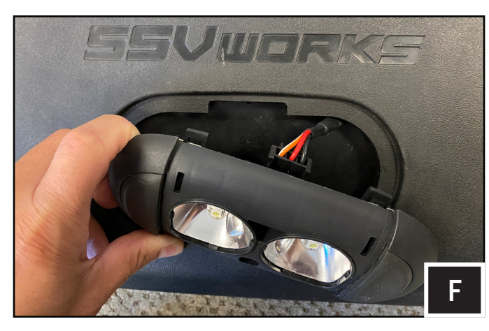
F. Connect the factory dome light into the SSV soundbar.