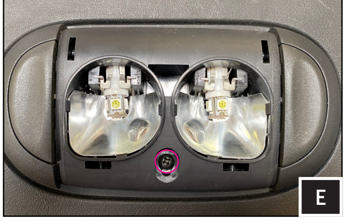
E. Extract the screw securing the dome light to the sound bar.