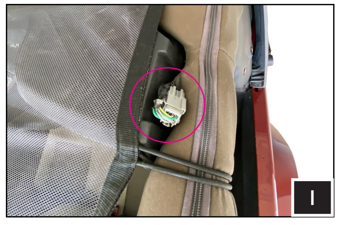
I. Hold the SSV soundbar up to the vehicle roll cage and connect to the factory plug.