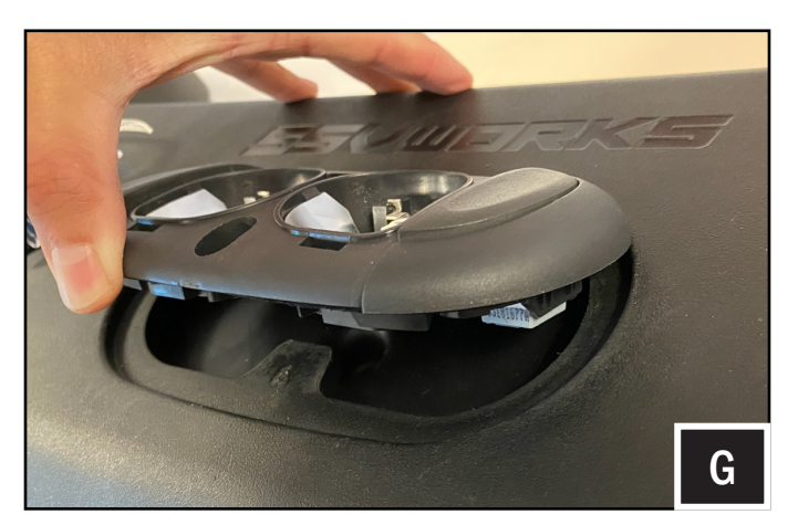
G. The SSV soundbar is made thicker than the factory soundbar to support the 8" speakers. The dome light will fit tight because of this. Angle in the dome light so both plastic tabs hook onto the material first then push in and lay flat.