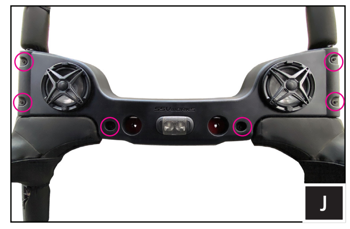
J. Using the factory x6 Bolts secure the new soundbar to the vehicle roll cage.