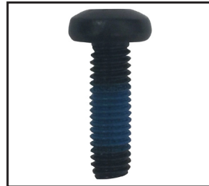
3. M6x1.0x25mm T30 torx screw x4