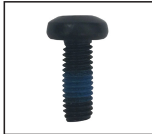
2. M6x1.0x16mm T30 torx screw x8