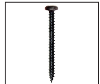
8. #7 - 19x1.25" screw x8