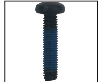
4. M6x1.0x40mm T30 torx screw x3