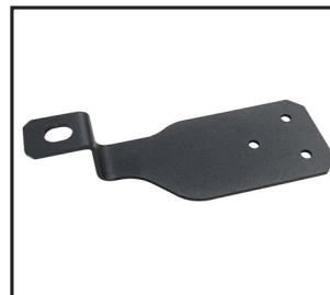
7. Bracket "MB-2"