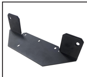
6. Bracket "MB-1"