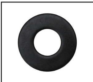
5. M6 washer x15