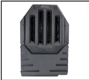
1. JJK-DS10 sub enclosure