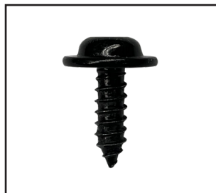
2. T-25 Torx Screws x4 (Factory Provided)