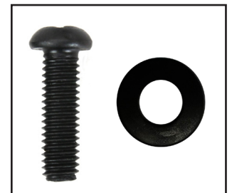
4. M6 Screws and Washers x 2