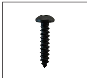
3. Phillips Screw x 2