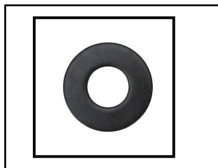
(x2) M6 Washer