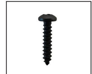
(x2) #1 Phillips Screw