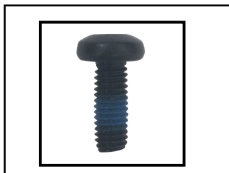
(x2) M6 x Screw