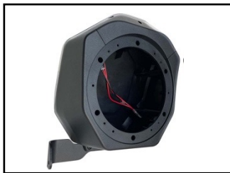
Passenger Rear Door Pod