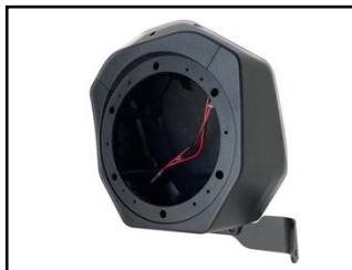
Driver Rear Door Pod