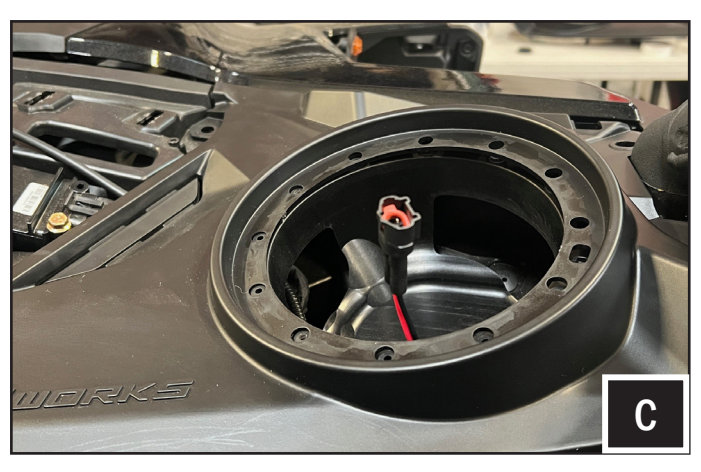
C. Put the panel on the dash and press in the bucket to the rubber grommet. Run the speaker wire to the speaker bucket.