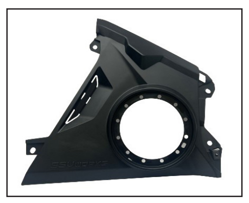
Speaker Panel, Passenger Side