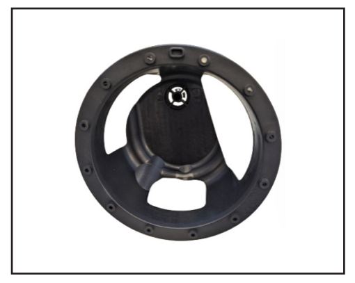
Speaker Base (x2)