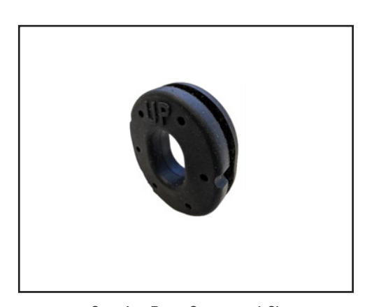
Speaker Base Grommet (x2)