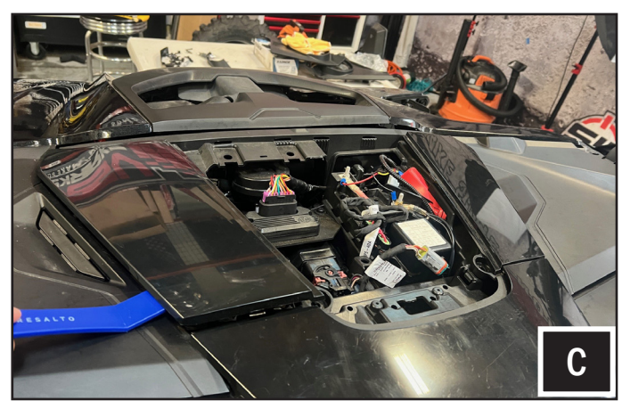
C. Use a plastic pry tool to remove the left and right side center panel trims.