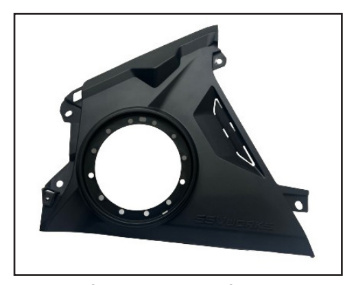
Speaker Panel, Drive Side