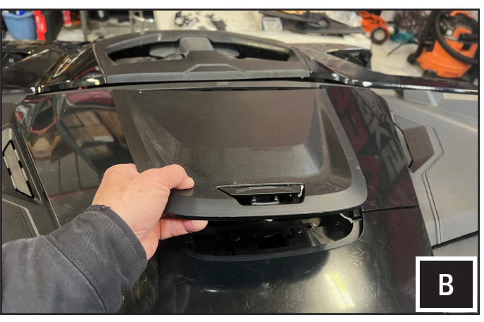
B. Remove the front fuse box cover.