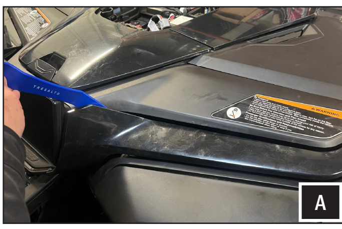
A. Use a plastic pry tool to remove the driver and passenger side front trims.