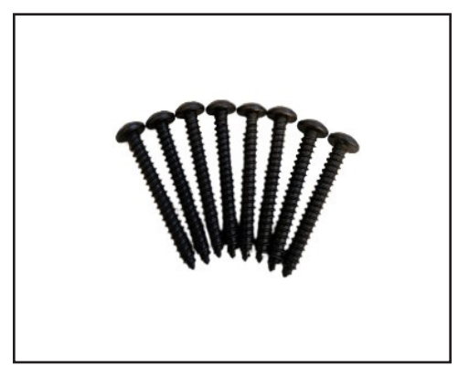
Speaker Screws (x8) [B-S1179]