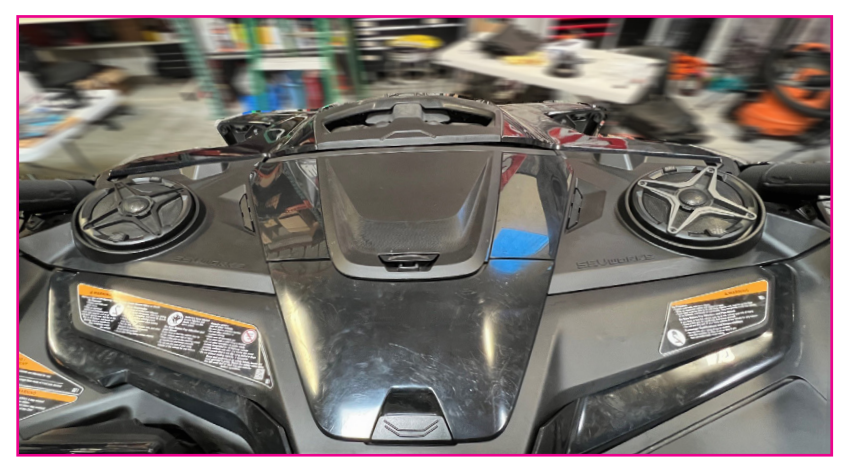
Reassemble the dashboard by reversing the disassembly procedure.