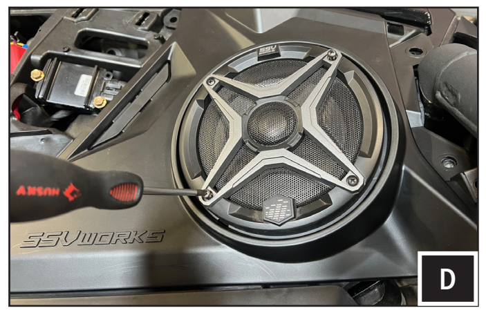
D. Plug in the speaker and mount it to the driver and passenger side Mav R speaker panels using the screws included with the speakers.