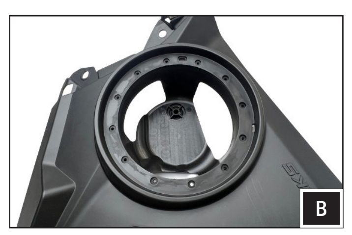
B. Hold the speaker bucket to the back side of the Mav R speaker panel.