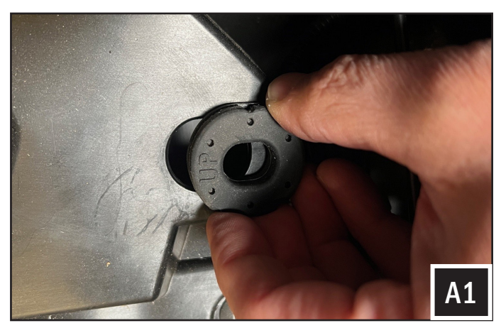
A1. Remove the driver side under seat storage bin by removing the 2 screws fastened to the floor.