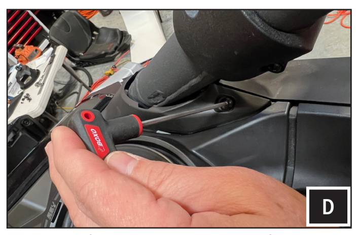
E. Remove the left and right side corner trims using a 3mm allen wrench.