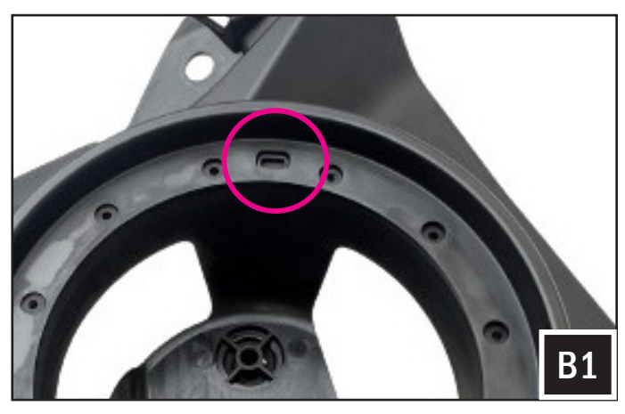
B. Line up the alignment peg of the speaker bucket to the oval hole on the Mav R speaker panel.