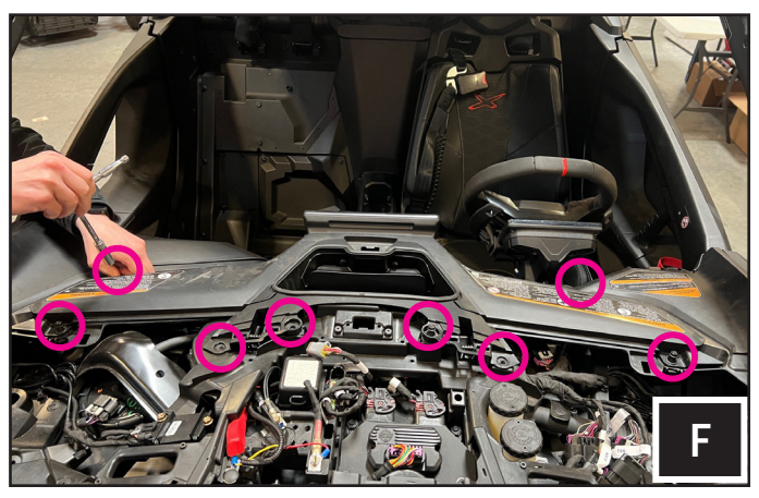
E. Remove the central dashboard.