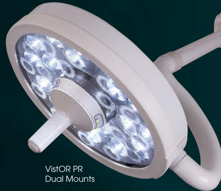
VistOR PR Dual Mounts