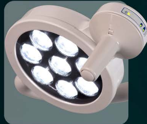
With Sterilizable Handle and Control Grip