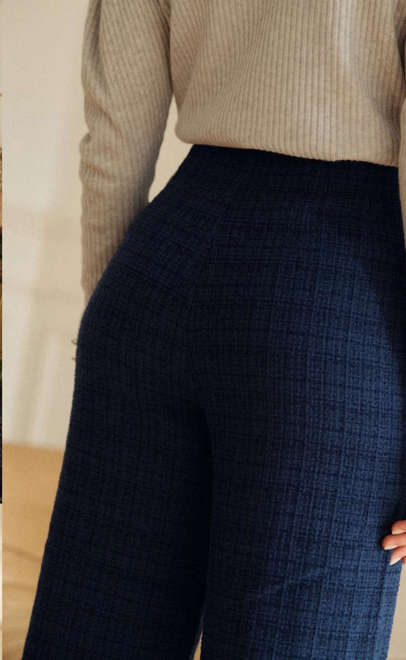
Pantalon en tweed Damien - 125 €