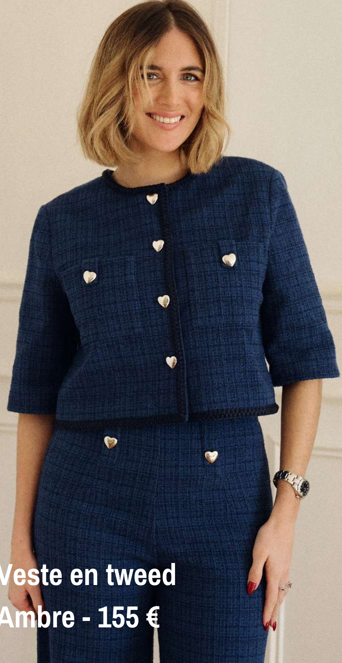
Veste en tweed Ambre - 155 €