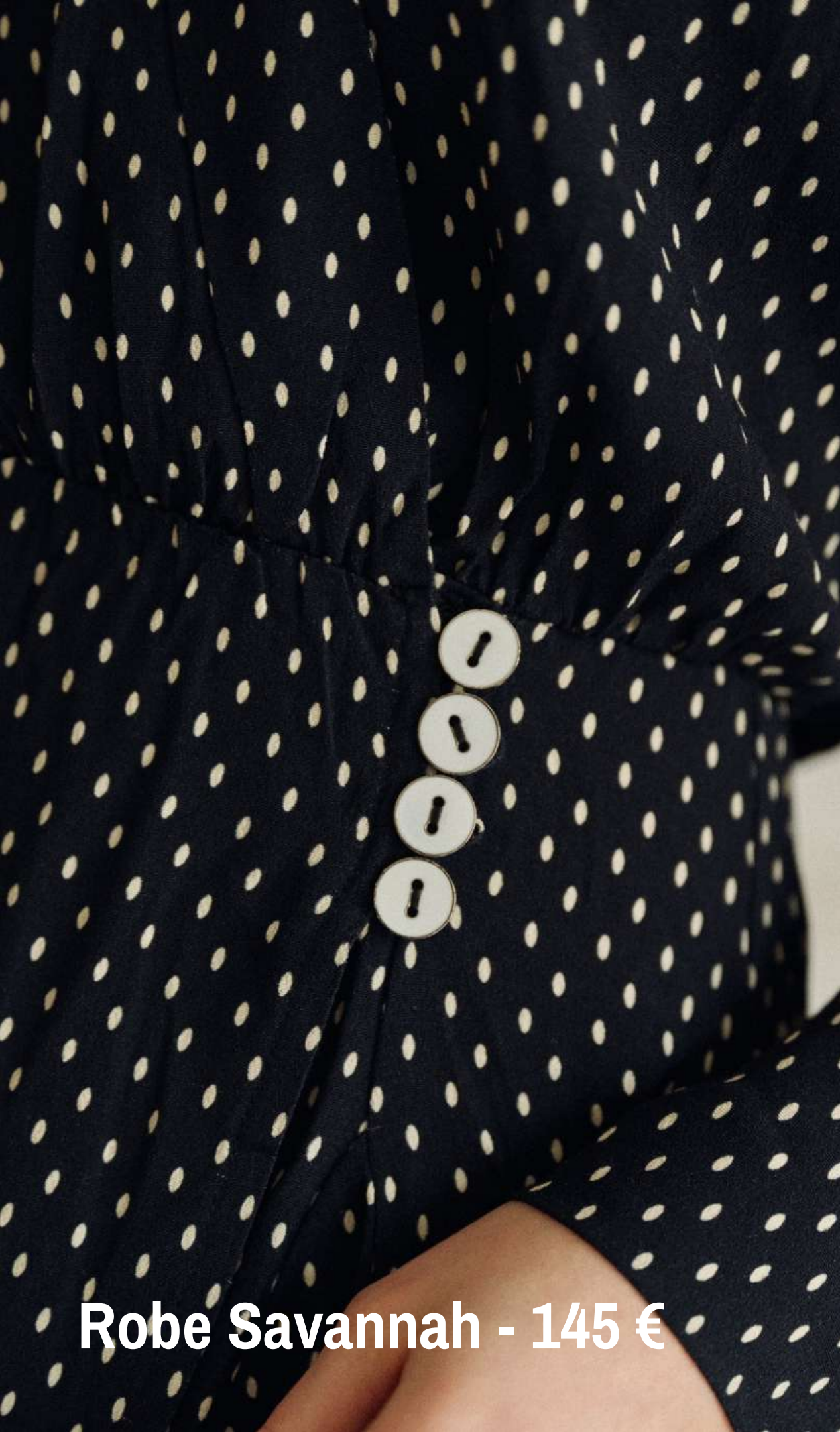
Robe Savannah - 145 €