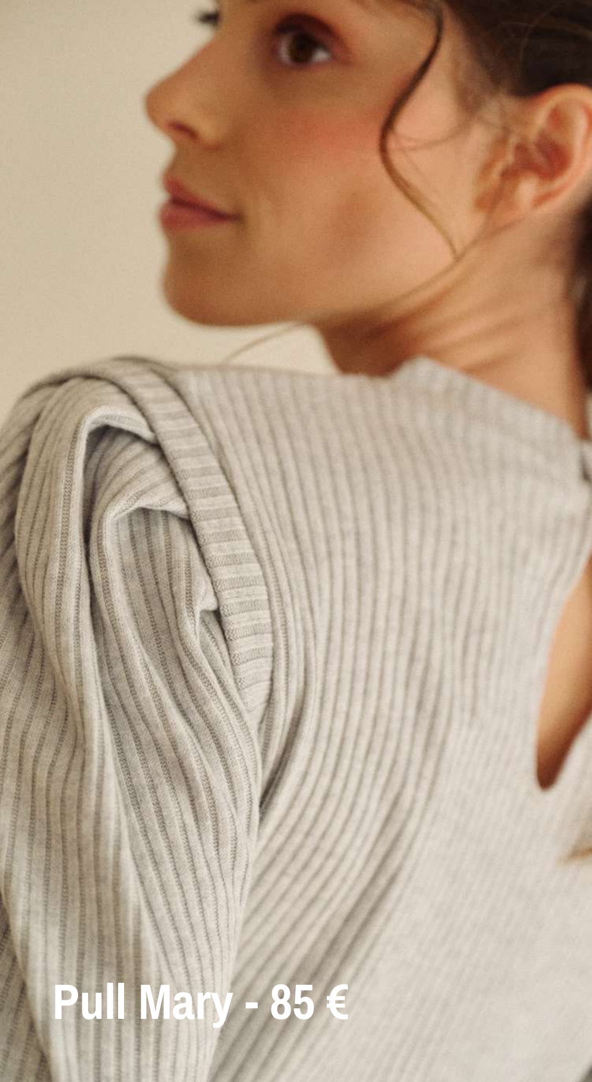
Pull Mary - 85 €