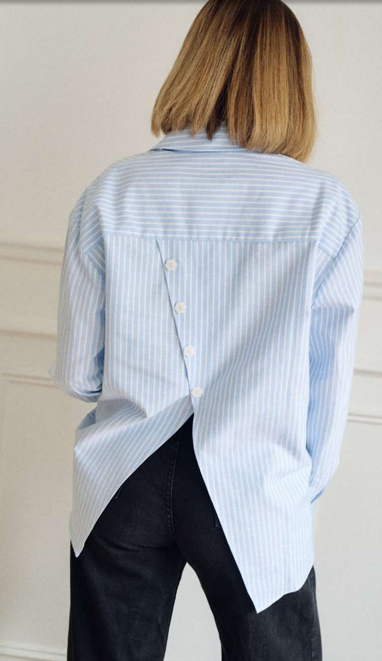
Chemise Harmony - 95 €