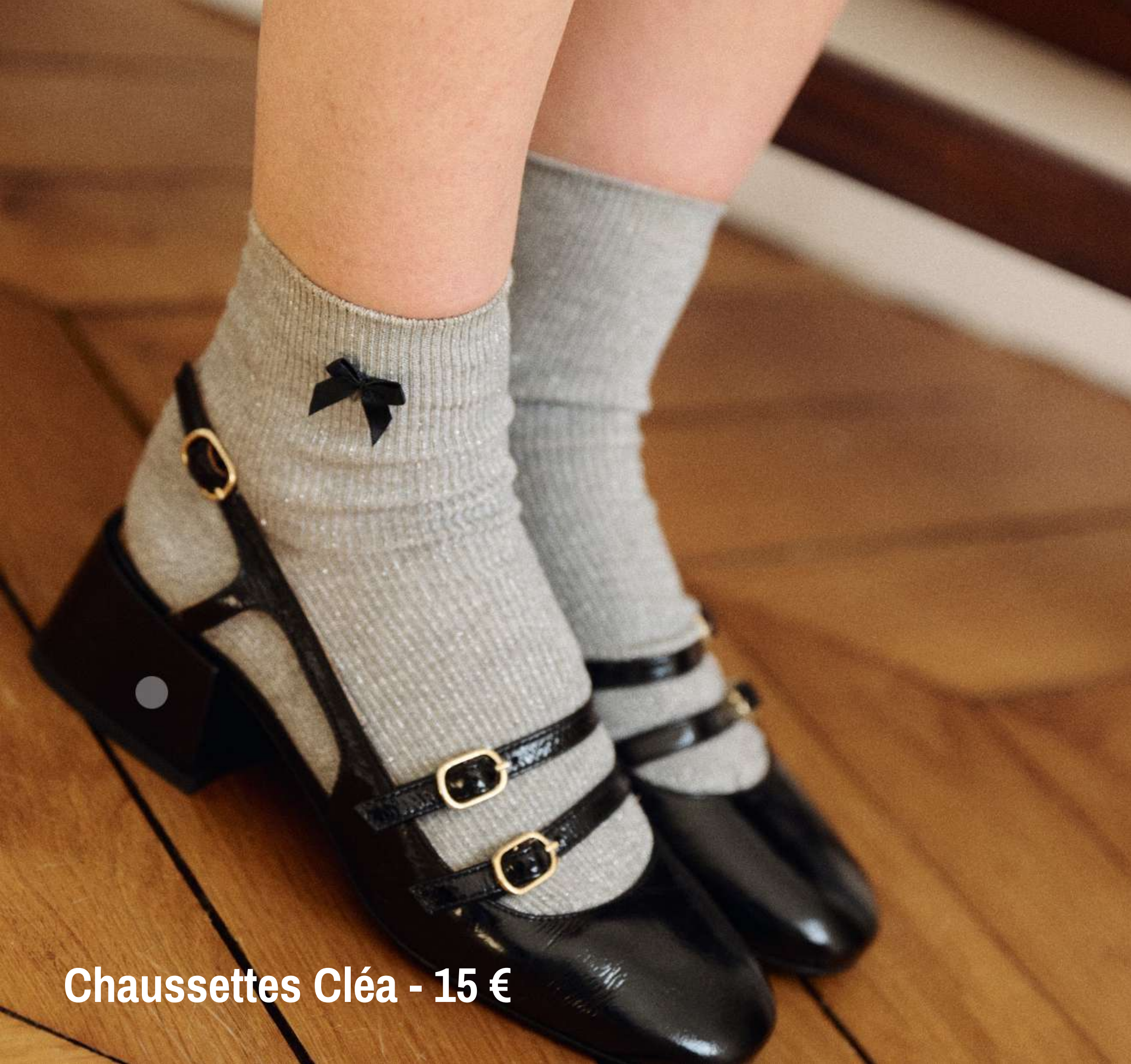
Chaussettes Cléa - 15 €