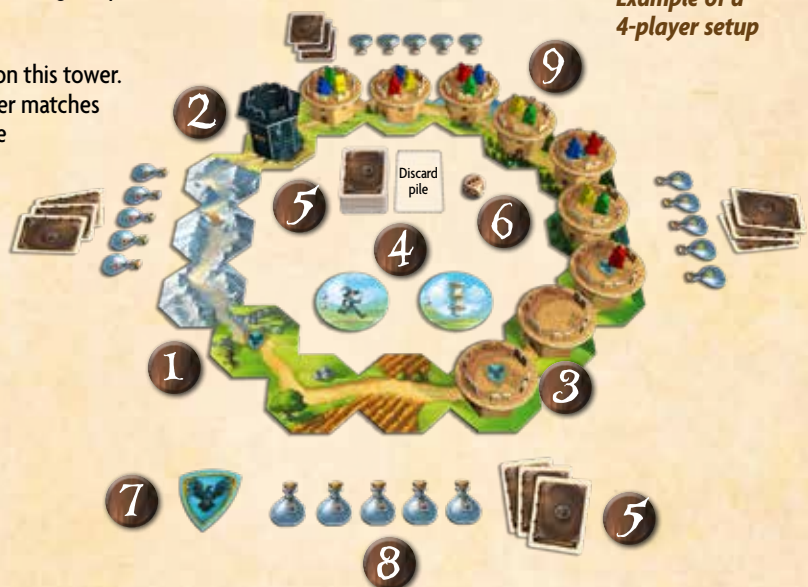
Example of a 4-player setup

In turn order, place 1 of your wizards on this tower. If the number of wizards on that tower matches the number of blue ghost lights in the tower's space, skip to the next tower clockwise. Continue like this until everyone has all of their wizards on towers.