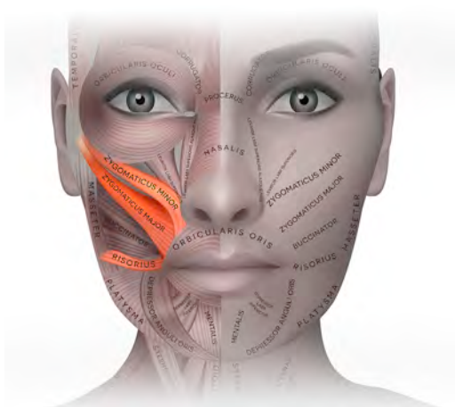
Fig. 2. The cheek muscles stimulated by HIFES technology: zygomaticus major and minor muscles and risorius muscle.

Simultaneously with the HIFES stimulation, the Synchronized RF that heats the facial tissue is delivered. Such stimuli affect the connective tissue framework and the facial muscle unit with consecutive adaptive changes to the overlying facial soft