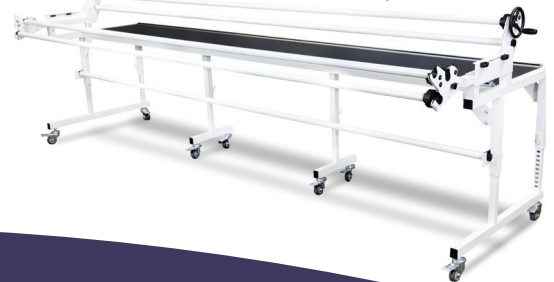
10-foot HQ Studio3 Frame with optional casters

The Amara 20-inch longarm machine with HQ Studio3 TM Frame (choose from 10-foot or 12-foot size options) has everything you need for free-motion quilting right out of the box, including a powerful, Handi Quilter standalone bobbin winder.