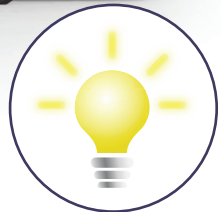
QuiltMaster TM LED lighting: throat, needle, and bobbin