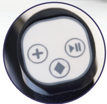
Independently adjustable handlebars with programmable buttons