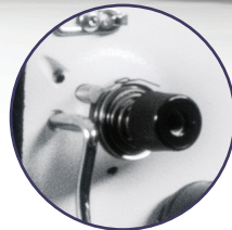
Easy-Set Tension TM