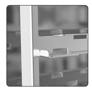
ANTI SLIPPING RACK RAILS.