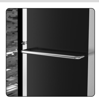
DISPLAY/CONTROLS PROTECTION IN STAINLESS STEEL.