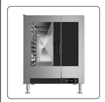
CONSTRUCTION IN FULL AISI 304, WITH FLANGED FEET FOR FLOOR FIXING.