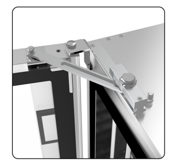
DOOR AUTOMATIC BLOCK/UNBLOCK SYSTEM.