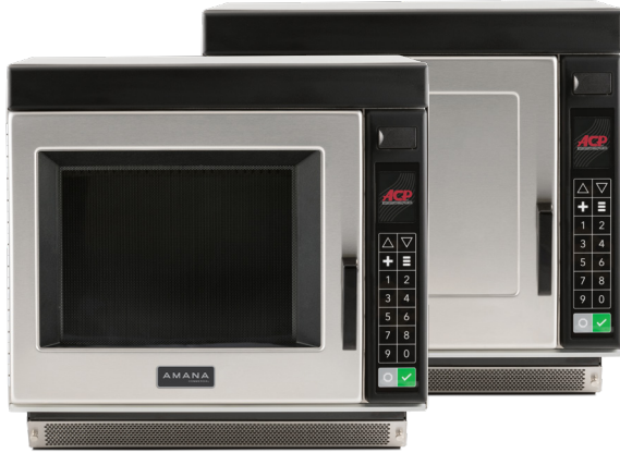
Left to right: RC window door style and RC solid door style (*S2D)