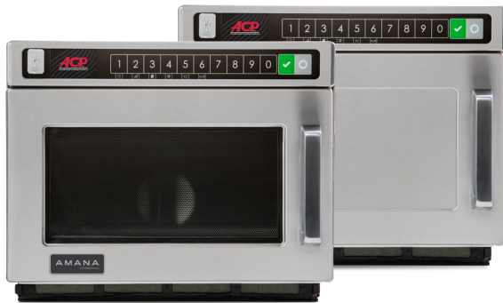
Left to right: HDC window door style and HDC solid door style (HDC18SD2)