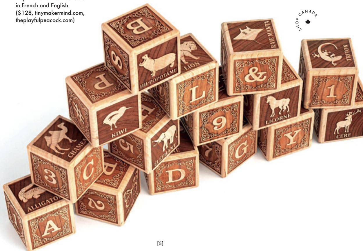
[5] – Fifteen solid cherry blocks, richly carved on all six sides by Manitoba craftsmen from Tiny Maker Mind. Available in French and English. ($128, tinymakermind.com, theplayfulpeacock.com)