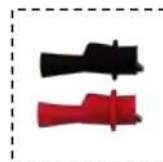
Alligator Clip (optional)