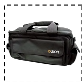
Soft Bag (optional)