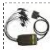
Logic Analyzer Module