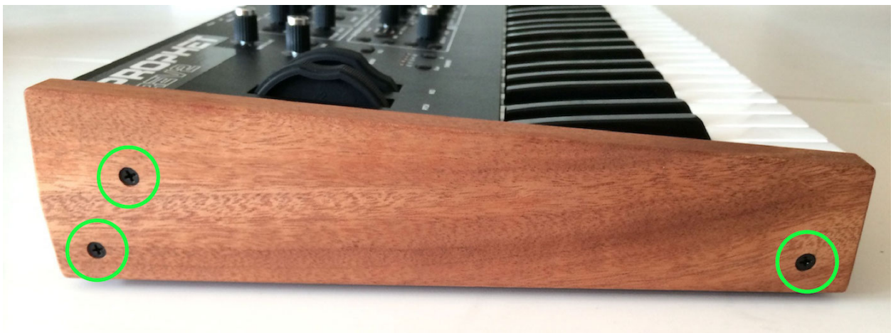
Left Wooden Side