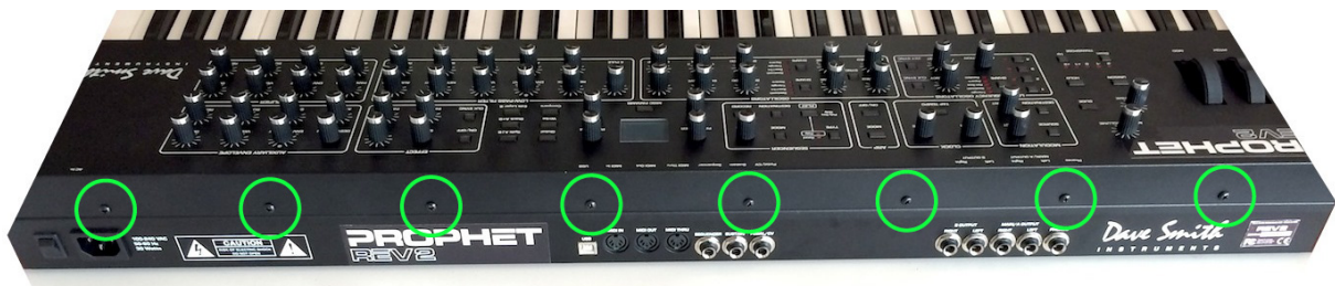
Rev2 Back Panel

4. Now remove the 8 screws across the back panel.