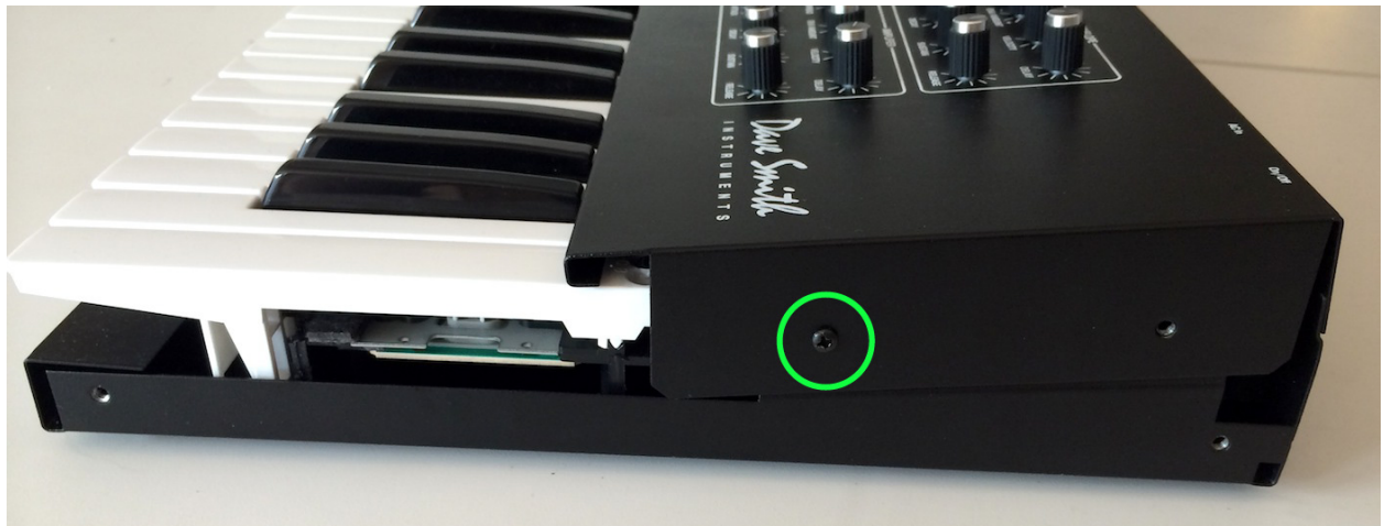
Right Side Screw

4. Now remove the 8 screws across the back panel.