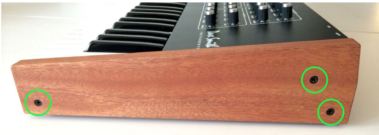
Right Wooden Side