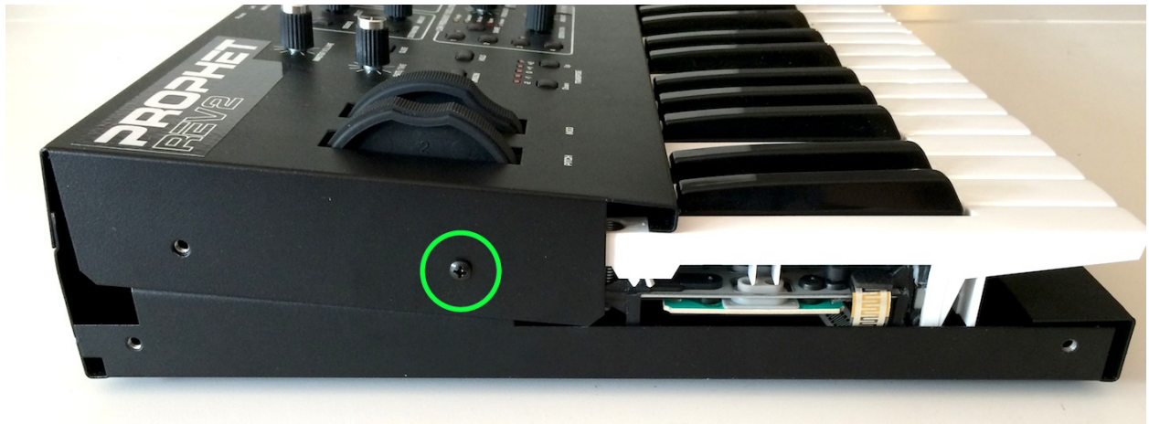
Left Side Screw

3. Underneath each wooden side, remove the 1 remaining screw from the metal.