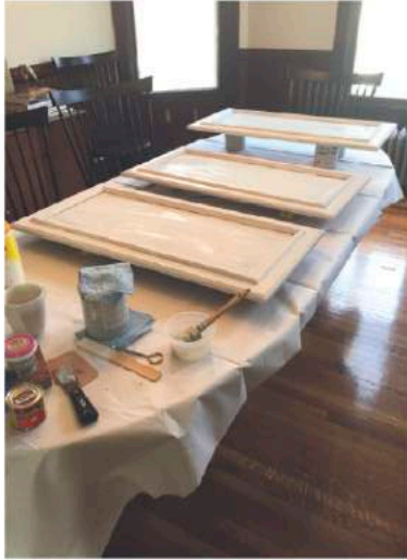
ABOVE “Tackling the project in small sections made it much more digestible. I did a bank of three upper cabinets at a time – taking the doors off and painting them on my dining table”