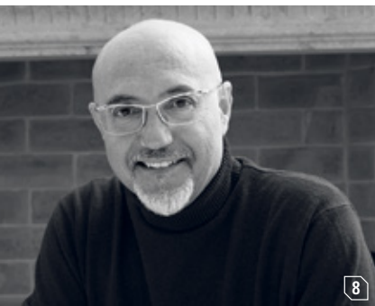
Giuseppe Bavuso for Rimadesio

product Air recap Made from 100 percent recyclable glass and aluminum via a solar-energy-powered production process, the Milanese architect's bidirectional pivot-door system eschews structural elements like jambs and frames for a minimalist flush, full-height look. rimadesio.it/en