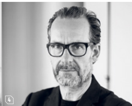
Konstantin Grcic for Alpi

product Arcobaleno recap A decorative veneer made of reconstituted wood is suitable for surfaces large or small, straight or curved; colors gradually blend into one another, forming a rainbow effect the designer describes as "psychedelic and pop." alpi.it