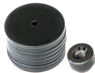
Counterweights and knob