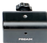
Tripod Mounting adapter