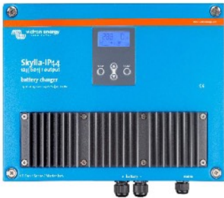
Skylla-IP44 12/60 (1+1)

To learn more about batteries and charging batteries, please refer to our book 'Energy Unlimited' (available free of charge from Victron Energy and downloadable from www.victronenergy.com ).