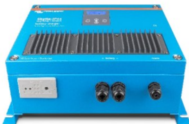
Skylla-IP44 12/60 (1+1)