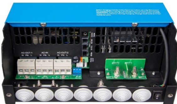
Connection Area MultiPlus-II 3k