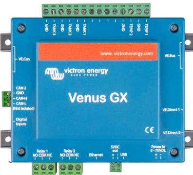
Venus GX with connectors