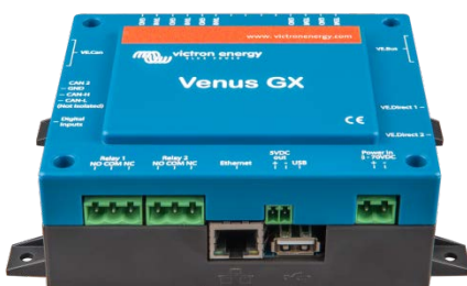
Venus GX front angle