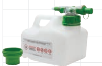
Jerry Can, Safety Spout & e-NRG bottle adaptor