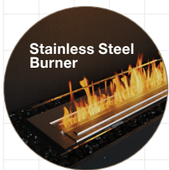
Stainless Steel Burner

Available in a timeless black finish, Flex Fireplaces come with Stainless Steel or Black burners.