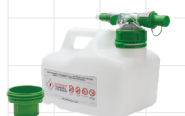
Jerry Can, Safety Spout & e-NRG bottle adaptor