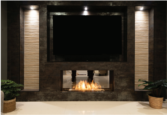
Flex 50DB (SIDE 1)