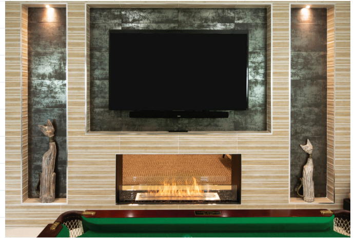
Flex 50DB (SIDE 2)