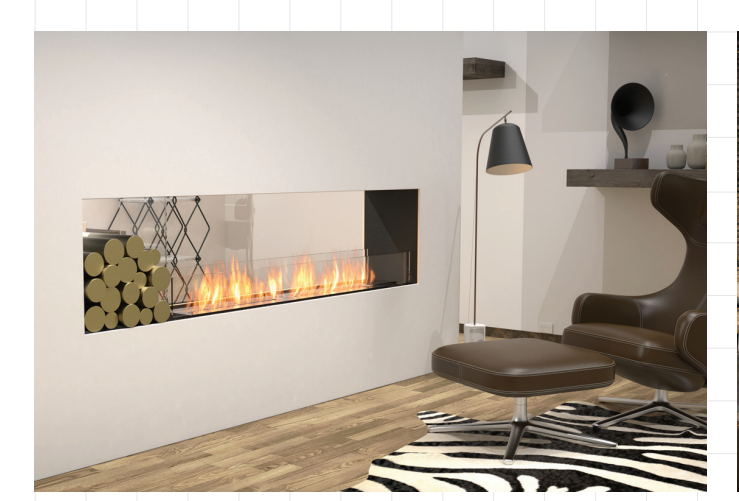
Flex 50DB (SIDE 2)